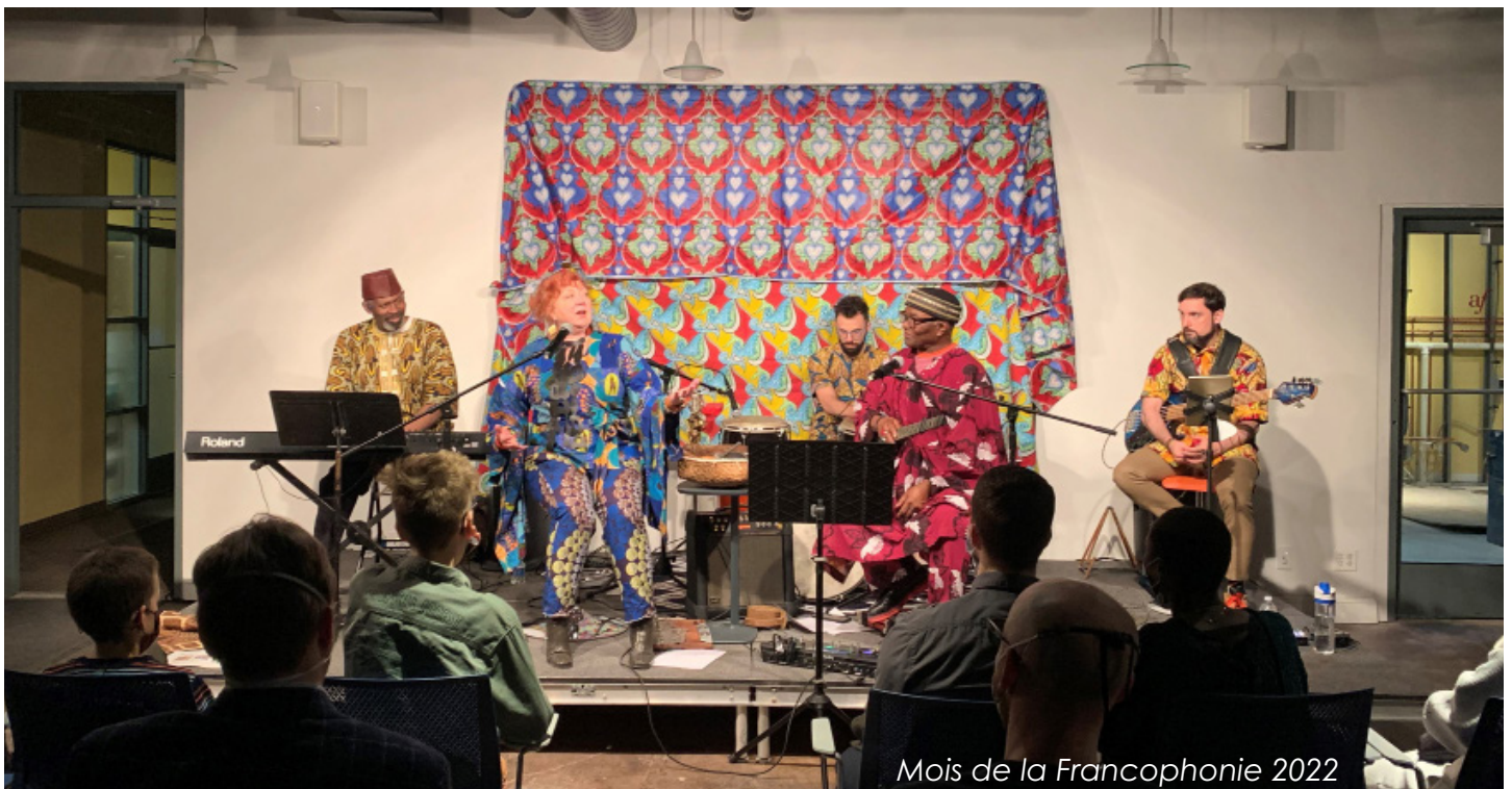
Mois de la Francophonie 2022