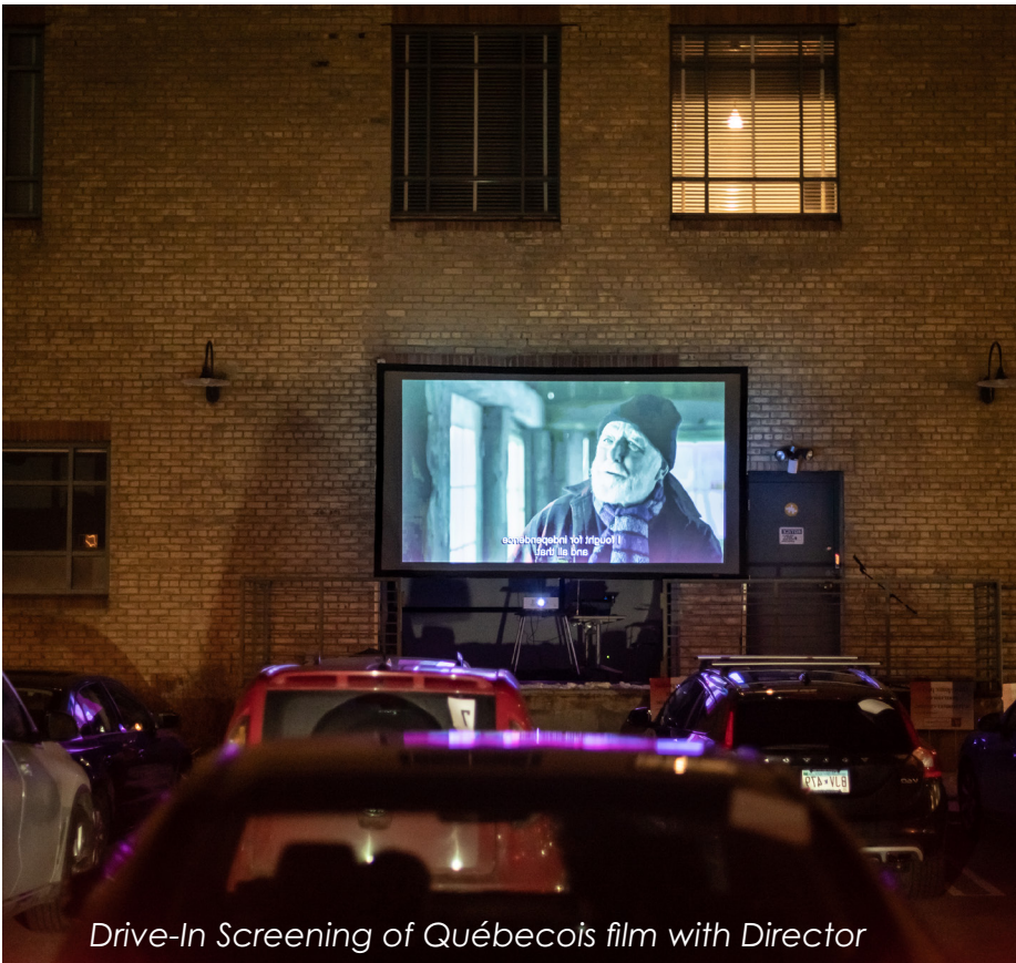
Drive-In Screening of Québecois film with Director